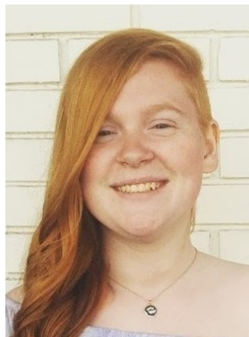
AAUW @ ARC Co-Presidents