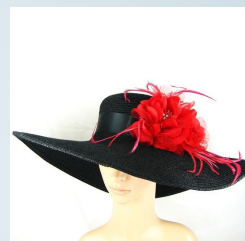
Fashions by Chochos